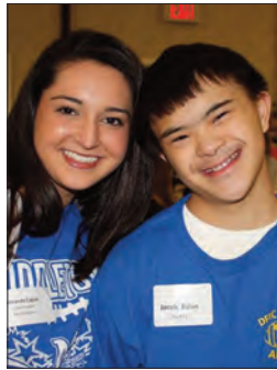
DFRC Blue-Gold All★Star Game